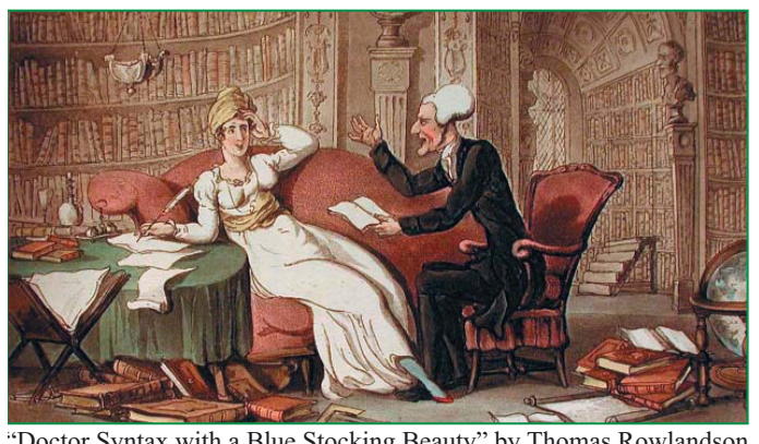
"Doctor Syntax with a Blue Stocking Beauty" by Thomas Rowlandson. From William Combe's The Third Tour of Doctor Syntax, In Search of a Wife (1812).

Eighteenth- and Nineteenth-Century British Women Writers in Special Collections