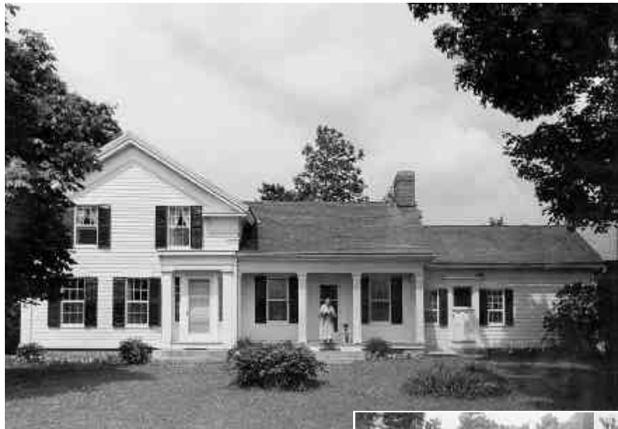
Above: Marjorie and dog Moe on the porch of her Van Hornesville house after she completed restoration

tedious. At one point, she complained, "I just can't write. Somebody else must have written 'The Yearling' " (Feb. 4, 1950). She resented friends who constantly inquired about her progress, noting to Norton and to the friends that such exposure was like being expected to make love in public. Alcohol was another distraction from