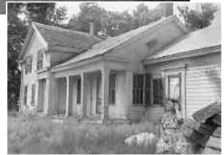
Right: Van Hornesville house before being restored

her work. Her custom was to try to get in at least a morning's writings before beginning to drink or yield to other distractions.